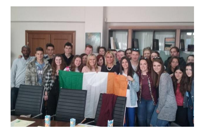
YOUTH EXCHANGES AND TRAINING:

The following gives just a taste of what you can experience with us!